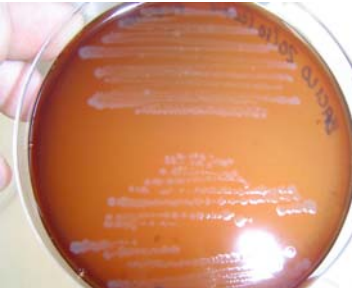
Fig 8. Putrid Brood samples Microbiologic Culture. Bacillus Gram -. 72 Hours. 37 °C. (Columbia Agar Medium)