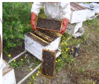
Fig 9. Macroscopically study March,2005.